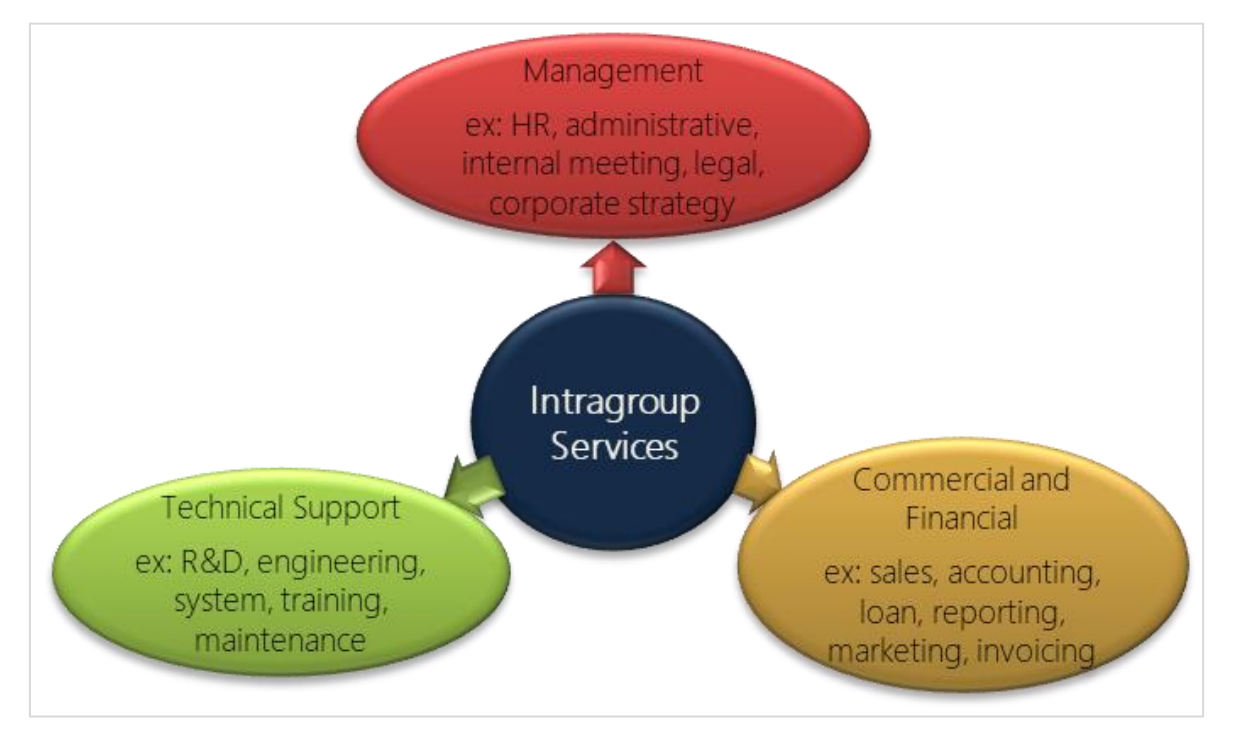
Figure 4 Author's Perspective: Categories of Intragroup Services

Around the globe, many countries are affected by the COVID-19 pandemic and MNEs should work effectively to overcome the effect of the outbreak. During the crisis, MNEs are faced with a number of challenges, including transfer pricing policies. As a consequence, tax authorities are likely to impose a transfer pricing audit to MNEs during and post pandemic. In DGT, the roles of tax auditor are essential to ensure that companies are adapting proper transfer pricing guidelines and regulations into their policies regarding COVID-19. In