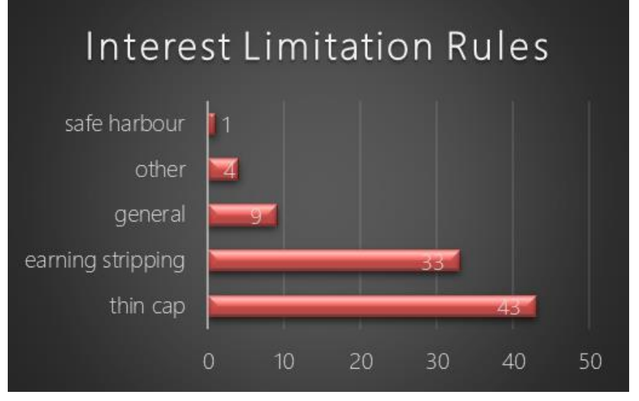
Figure 3 Interest limitation rules across the OECD/G20 Inclusive Framework

excessive proportion of group's total net third party interest expense, or bears the burden of interest deductions on debt used to earn non-taxable income (OECD, 2020b). OECD defines banking sector and insurance are not subject to DER regulations. However, Indonesia's DER regulations added four types of taxpayers who are not subject to DER regulations including financial institutions, mining and oil and gas, infrastructures, and businesses subject to final income tax. Furthermore, according to the OECD, interest limitation rules have different forms. The most common type is thin capitalization rules (43 tax jurisdictions including Indonesia), followed by earning stripping rules (33), rules of a general nature or not specified (9), rules of another type (4), and lastly, safe harbor rules (1) as can be seen on Figure 3.